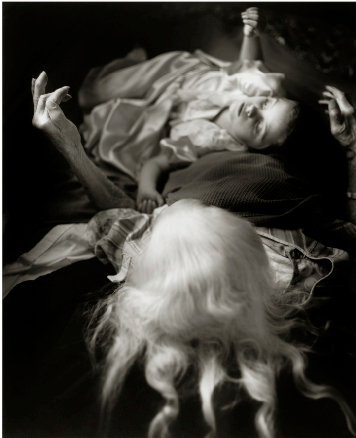
"The Two Virginias #4," 1991. Photograph by Sally Mann