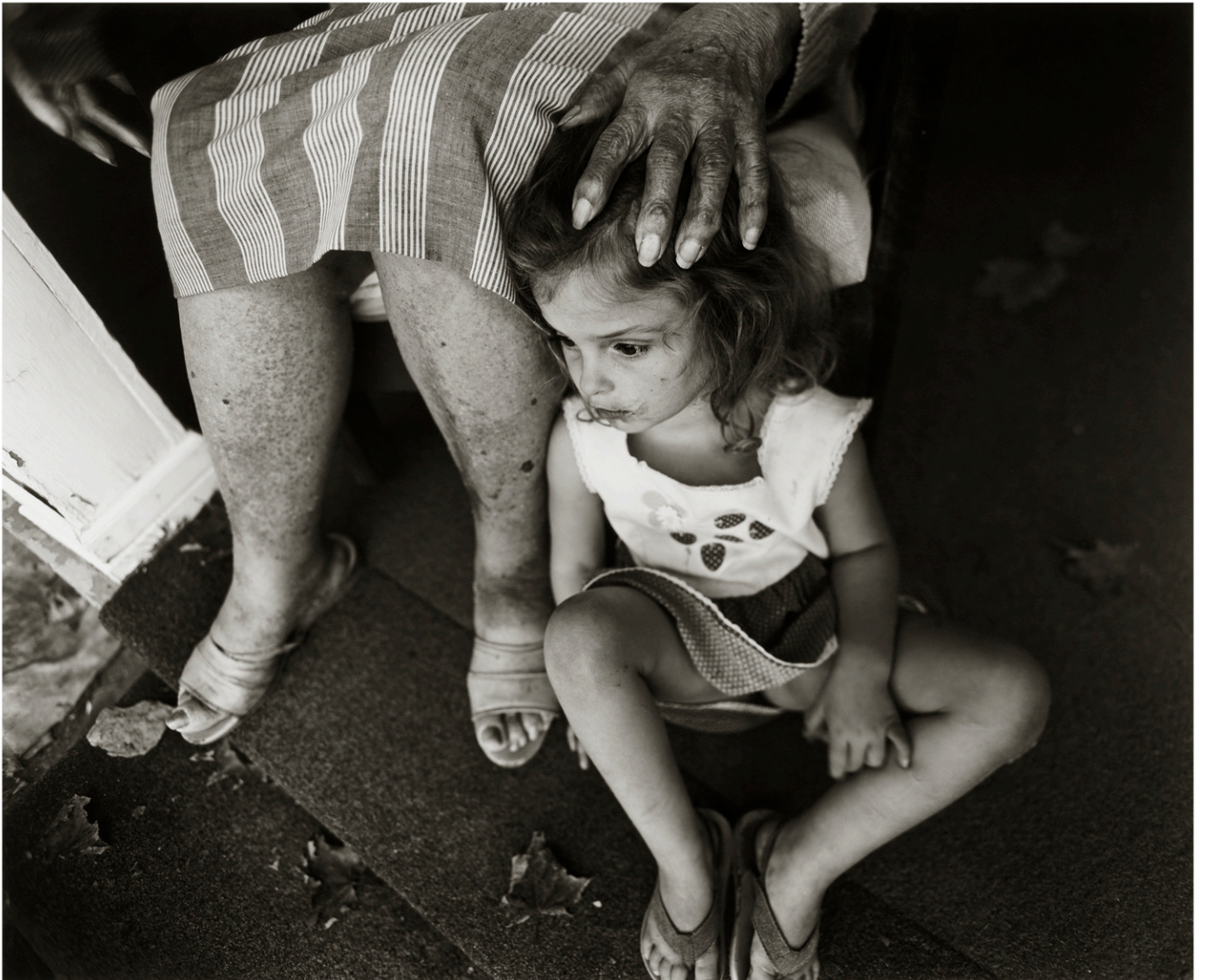
"The Two Virginias #1," 1988.

Who like Thyself my guide and stay can be? Through cloud and sunshine, O abide with me!