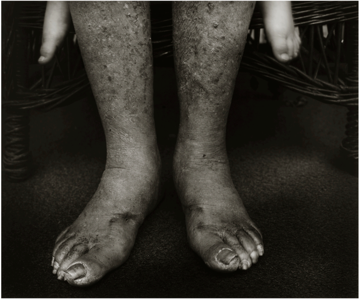
"The Two Virginias #3," 1991.

As Mann journeyed into the Deep South, she was guided in part by the Southerner's interest in lore, place, and the ties that bind and abide, along with her willingness to revisit or discover where she had not gone before, to see those places and faces and territories that her eyes saw growing up but maybe hadn't sufficiently registered from the distance of her class and race. It was the world in which her whiteness flourished. She writes, in her memoir, " Hold Still ," "I had always seen, but not seen, black men on the fringes of white life, mowing, tending bar, or waiting for work in the shade of the big trees at the courthouse." Who were these men on the margins? Who were the black people who called her "Miss" and her brothers "Master"? To hear these words—the language of subservience, of the supplicant—is to be in an old familiar Southern movie, a black strip of film illuminated by scenes of violence and subjugation: there can only be a master if there is a "nigger."