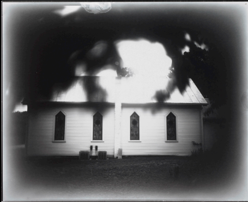
"Beulah Baptist 01:01," 2008–2016.

We're in Virginia, where the photographer Sally Mann was born, in 1951, and where she still lives, making work so rooted in place that it is inseparable from history, from lore, and from the effects of slavery. Like Janus, she looks forward as she looks back, at all those bodies that made her and her place in Virginia, and into the landscape, filled with rutted earth, big or low clouds, storybook fantastic vegetation, and the Southern light that reminds so many of photography itself—dark, as Joan Didion wrote, and glowing “with a morbid luminescence.” That entire vision is a part of Mann's photographs, as she asks in these images of family members, roads, rivers, churches, and the effects of blackness on whiteness and whiteness on itself: Abide with me . And it all does—voices, sounds, the invisible things that Mann's haunted and haunting photographs allow us to see.