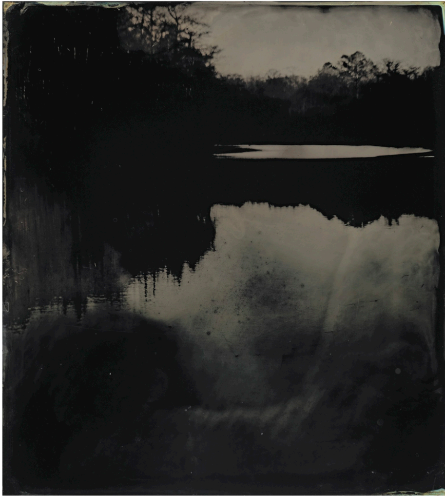
"Blackwater 17," 2008-2012.

Who was this white girl who wanted to know the stories behind those black faces? When it came to ideas about the South, and by extension her cultural and political inheritance and how the region worked, Mann “had to learn many things” on her own. As a young person, she was fascinated by a story that was endemic to Virginia and Virginia ways: the minister Nat Turner, his revolt, capture, and death. As an adult, Mann photographed in and around the Blackwater and Nottoway Rivers, which served as one line on the Underground Railroad. (This path to freedom, and especially the fact that a white woman was recording it, brings to mind the controversy that surrounded William Styron’s powerful novel “The Confessions of Nat Turner.” )