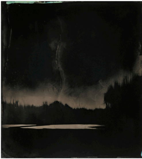
"Blackwater 9," 2008-2012.