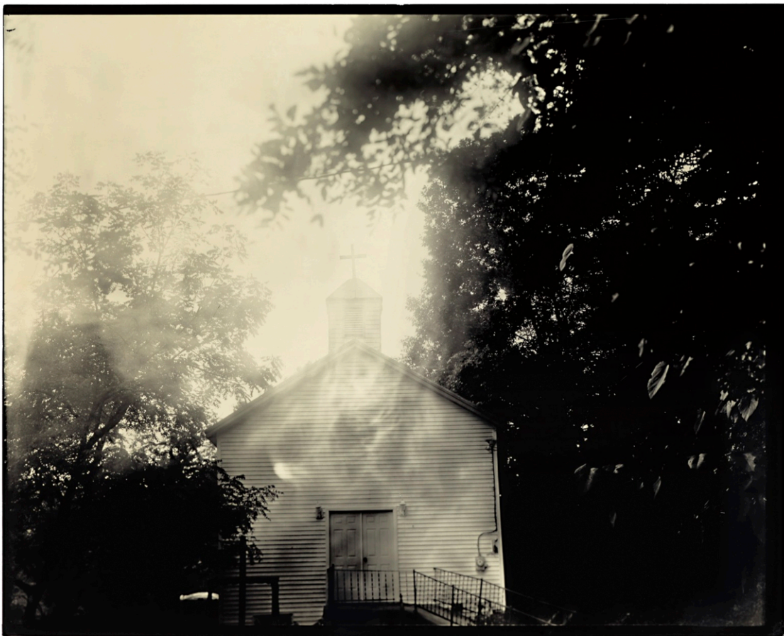
“Oak Hill Baptist 01:01,” 2008–2016. Photograph by Sally Mann

When other helpers fail, and comforts flee, Help of the helpless, O abide with me!