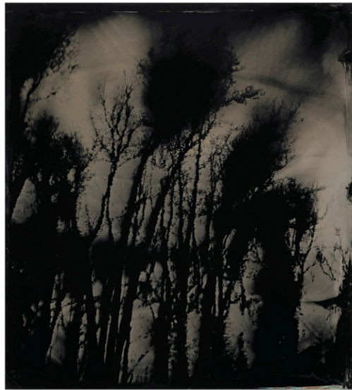
"Blackwater 20," 2008-2012.