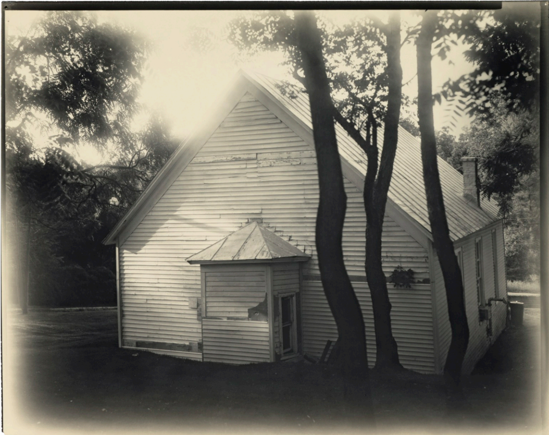
"St. Paul African Methodist Episcopal 01:01," 2008-2016.

"Unless the novelist has gone utterly out of his mind, his aim is still communication and communication suggests talking inside a community," O'Connor wrote, in her 1963 essay "The Regional Writer." "Our best writers are able to do this. They are not alienated, they are not lonely suffering artists gasping for purer air." The community members whom Mann speaks of and with in her memoir and in these photographs are alive and intimate, but I think loneliness asks Mann to abide with her, too. It's not just the loneliness we feel when we see the inevitable gulf between the thing being observed and the observer but also the great loneliness found in the South meeting the loneliness of the Southerner. In a 1946 essay about his native New Orleans, Truman Capote said that, to him, the city's streets had "long, lonesome perspectives." Mann's view—her understanding of the long, lonesome perspective even within community—is that the South can be unbearable to look at. And yet she makes it bearable enough to make a photograph from it. A question I discovered early on, looking at her landscapes, is, When will the South stop being the South? Stop being a place of blood ties, spilled blood, black and white blood, blood money, bloody earth?